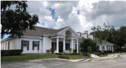
Citrus National Golf Club